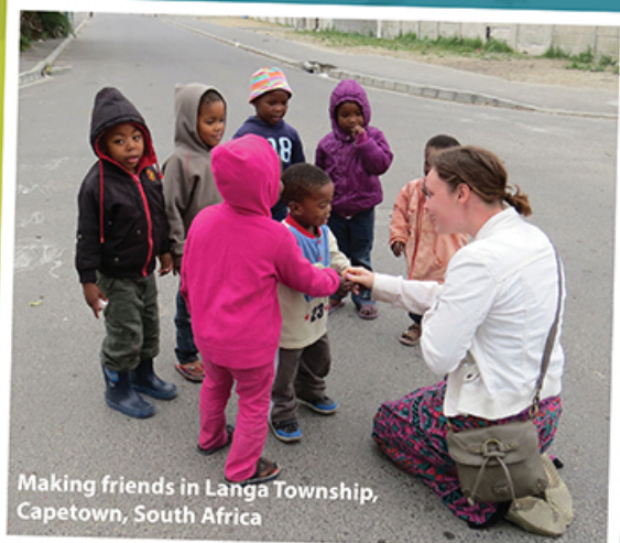
Making friends in Langa Township, Capetown, South Africa

Students from two Franciscan universities went on a Short-Term Mission and Global Awareness Trip to South Africa . By meeting with miners, people who had HIV/AIDS, and members of the anti-Apartheid movement, the students learned about a variety of social justice issues. Prayer and guided reflection helped them deepen their understanding of others' realities.