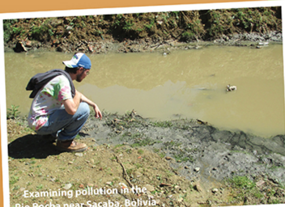
Examining pollution in the Rio Rocha near Sacaba, Bolivia