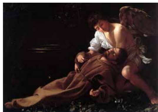
Caraggio, Embracing Sister Death