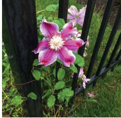
Flowers growing through and beyond their fences in Brookland, Washington, DC.